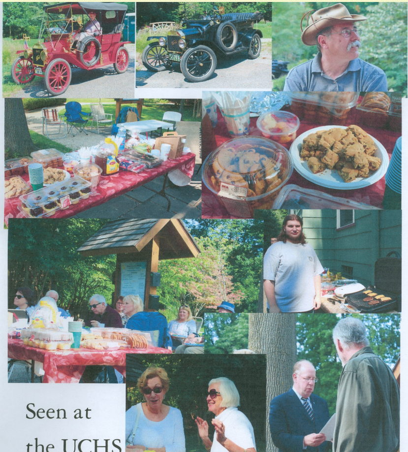
Seen at the UCHS